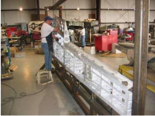
P-38 Wing Structure at Ezell Aviation

You A&P's, have you ever been told that those holes in the wing ribs were "Lighting Holes?" Some instructors taught that those holes were for light to shine through for mechanics to see during inspections.