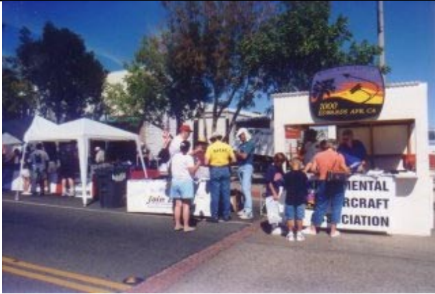
The Center of the Action