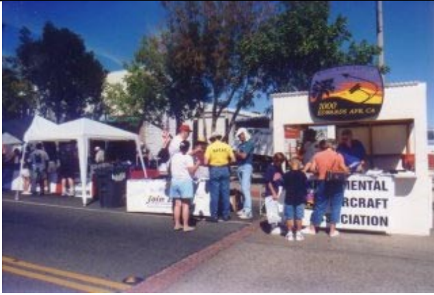
The Center of the Action