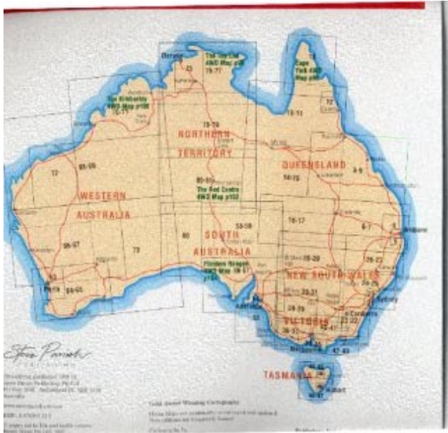
Map of Australia. Perth is located in the state of Western Australia, down near the southwest corner

Everyone present seemed to enjoy the presentation judging by the number of questions. The questions continued at the BK as those present enjoyed a full and satisfying meal.