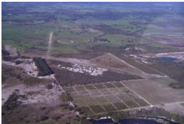
Overhead view of Serpentine Airport