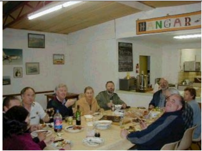
Some of the other airport denizens