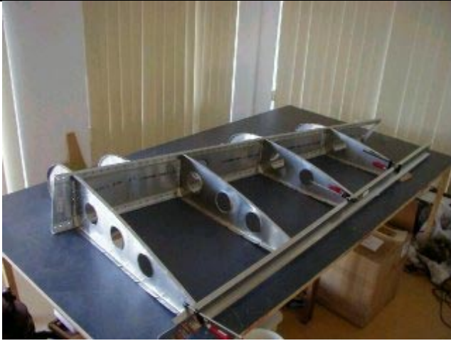
Spars and ribs of one wing panel of Graham's Zodiac